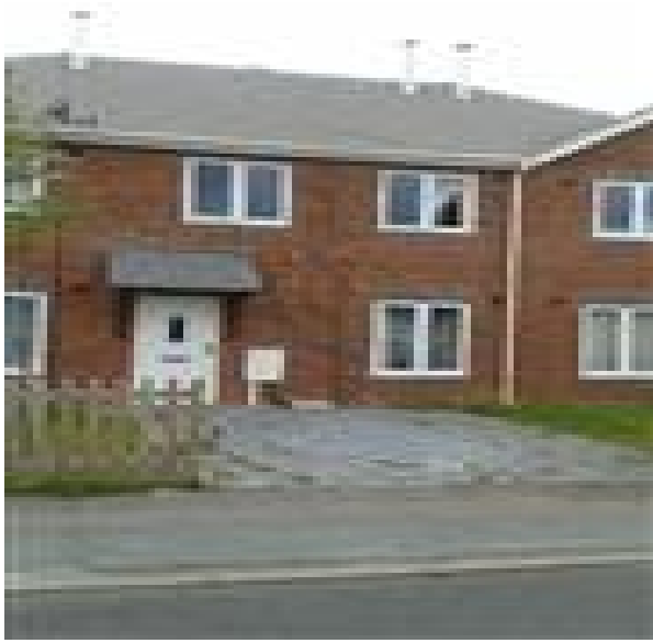
Affordable housing at Adelaide Road, Elvington

Which benefited from S106 funding from developments at 59 The Marina, Deal 12/00455 and Land rear of Old Park Close, Dover 12/00045