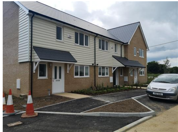
Affordable housing at George Close, Capel le Ferne

Which benefited from S106 funding from developments at 59 The Marina, Deal 12/00455 and Land rear of Old Park Close, Dover 12/00045