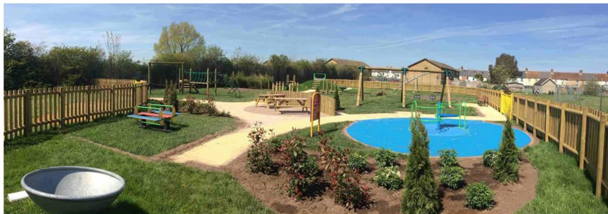
Image of new play area at North Deal playing fields

This play area benefited from S106 funding from the Cannon Street development 09/00873 and the Former Bede & Dunstan House 13/00522